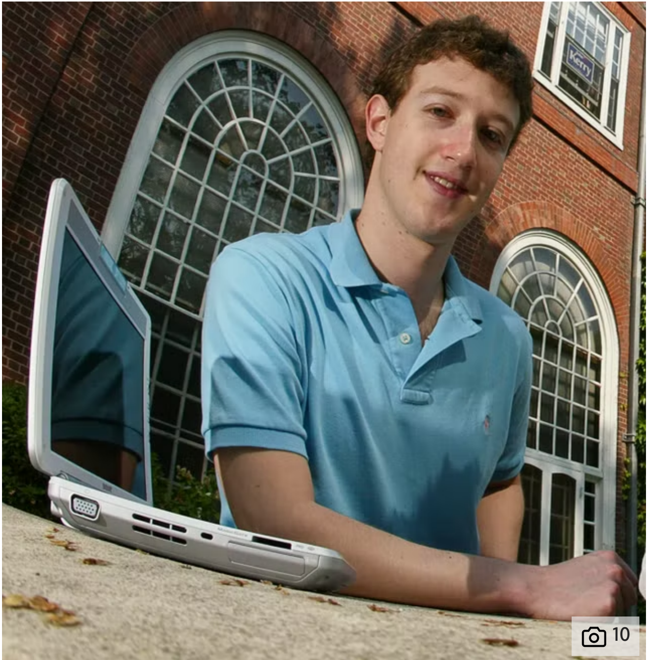
Mark Zuckerberg, the creator of Facebook, photographed at Harvard University in 2004 when the platform was created

If there were any doubts about how central a place Facebook, WhatsApp and Instagram now play in our lives, that recent outage laid them finally to rest. For many affected, the experience was at least as unsettling as being without electricity or water: a sudden incapacity, coupled with an eerie sense that all is not right with the world and rising panic about how to cope if normal service isn't soon resumed.